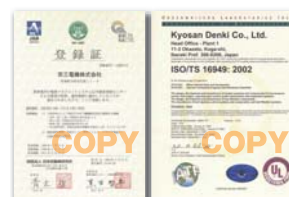
ISO 14001 ISO/TS 16949

Kyosan obtained ISO 14001 Certification in 1999, and ISO/TS 16949 Certification in 2005.