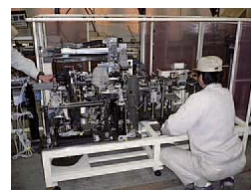
Fabrication of re-winder

Kyosan has developed its own production equipment in order to create high quality products at low cost.