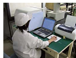
Measuring environmental impact

Kyosan Denki Co, Ltd. is an OE Manufacturer for: Toyota, Nissan, Honda, Mitsubishi, Daihatsu, Fuji, Kubota, Yamaha, Komatsu, and Denso.